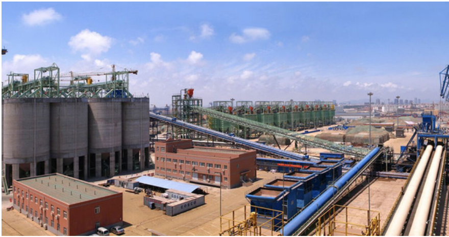
Rizhao Jurong Port Terminal (Rizhao)