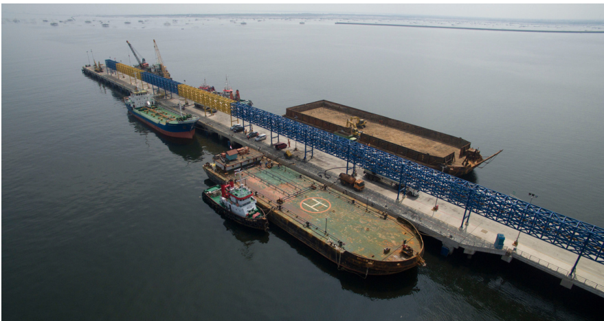
Marunda Centre Terminal (Jakarta)