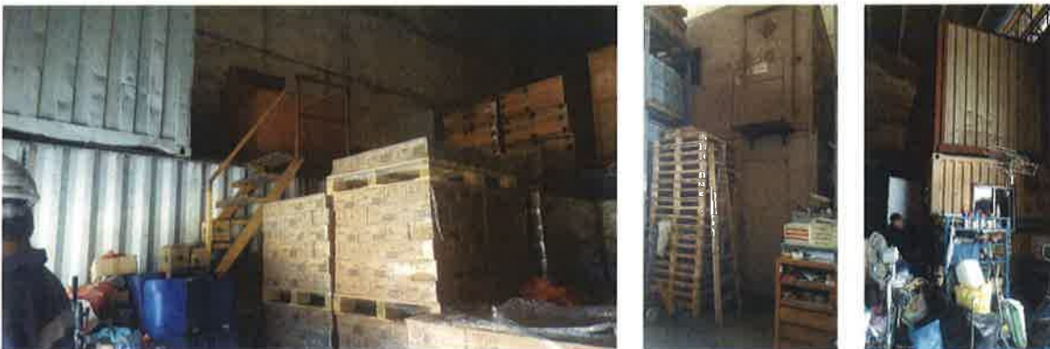
Fig. 2. Poor emergency escape route(s)

Unapproved deployment of office containers often lead to non-compliance with the Fire Code resulting in increased fire hazards.