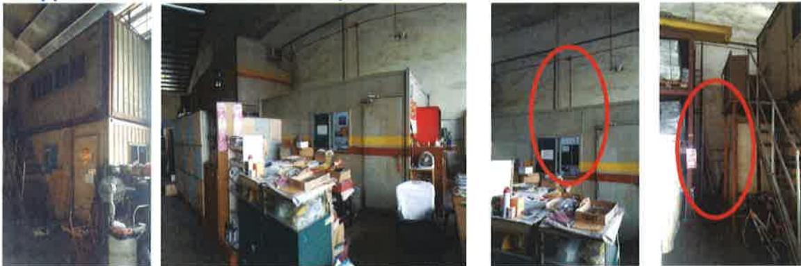
Fig. 1. Container office obstructing firefighting provisions