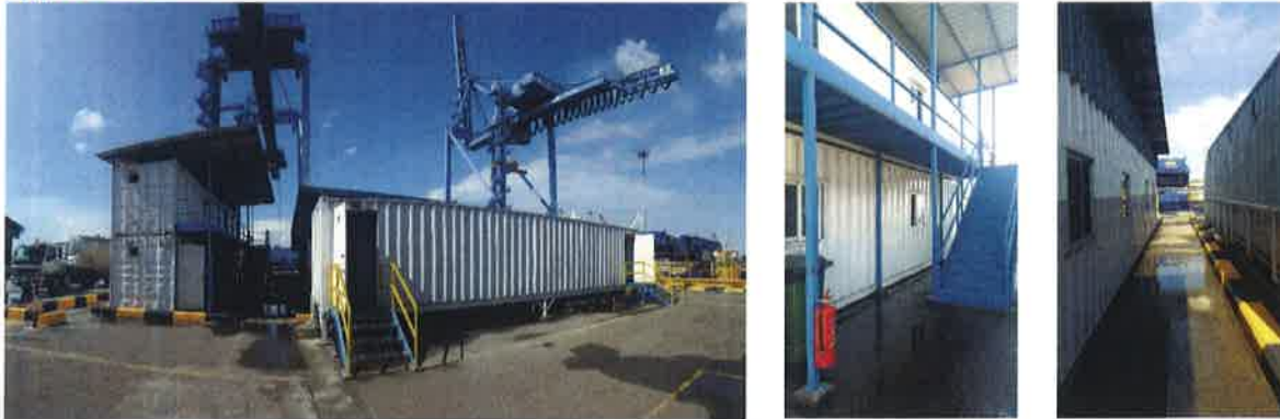
Fig. 3. Approved plan provides sufficient space for escape route and ensures firefighting equipment are not obstructed.