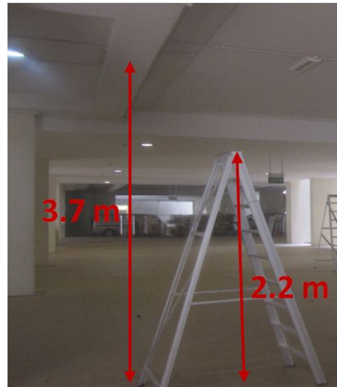
Figure 1: The workers were working on the A-Frame ladders when they lost their balance and landed on the concrete floor