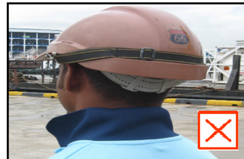
Chin strap behind safety helmet