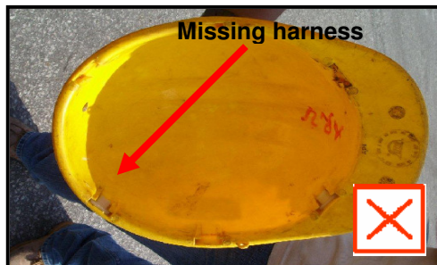
Safety helmet without harness