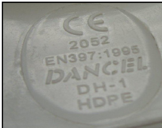
Manufacturer's name, trade mark and type of helmet