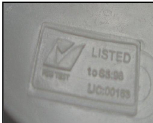
Number of this Singapore Standard, ie. SS 98