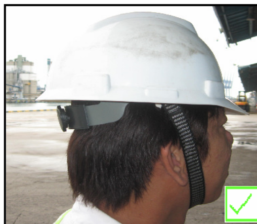
Proper Use of Safety Helmet with chin strap