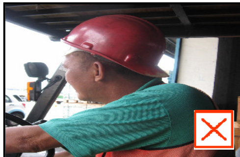
Safety helmet without chin strap